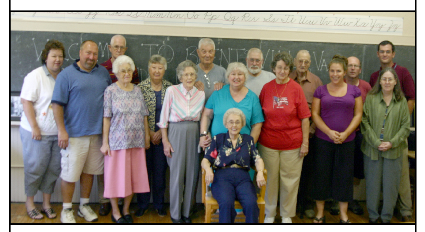
Students, family and friends who braved Tropical Storm Hanna to attend the 2008 Reunion